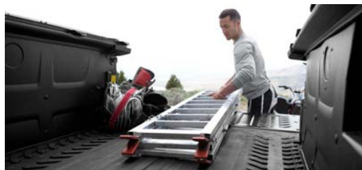
The cargo box stretches to one of the longest beds on the road. A removable three-piece cargo cover slides in to make the bed more secure. Lockable sidewall storage boxes corral loose tools and gear.