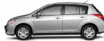
1.8 S: HATCHBACK AND SEDAN