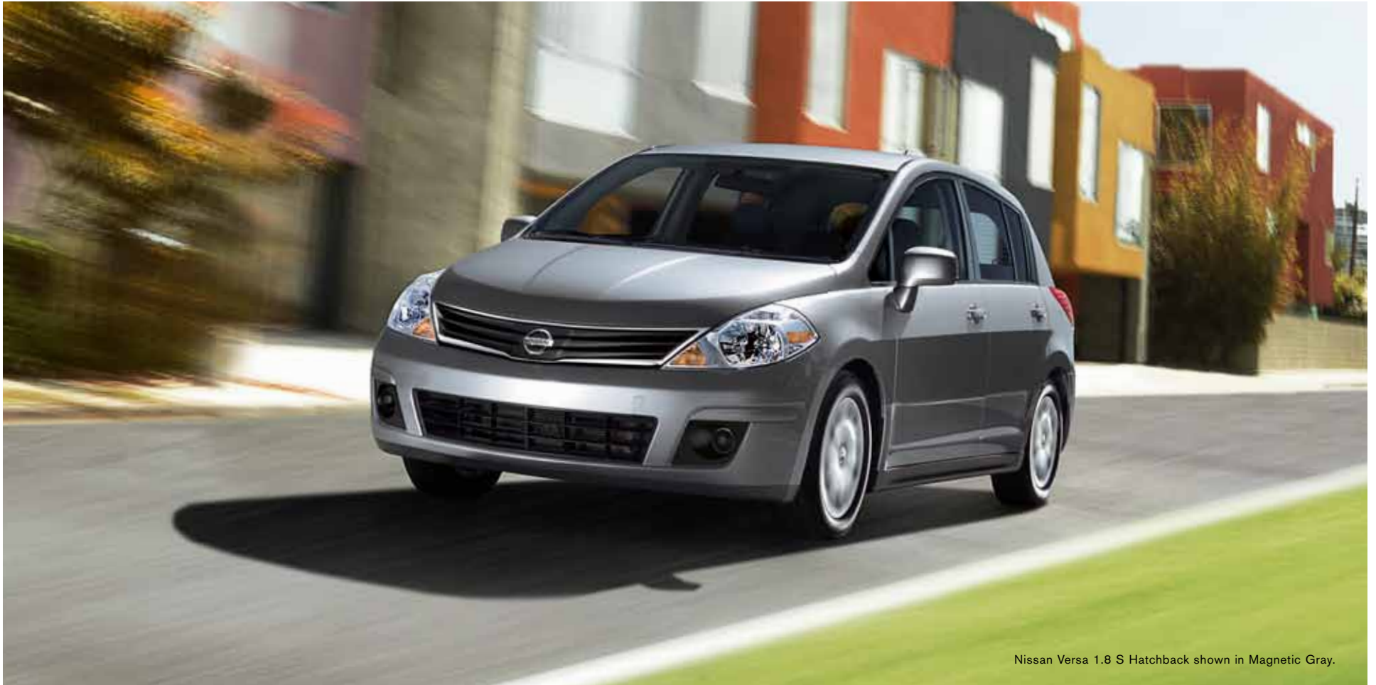
Nissan Versa 1.8 S Hatchback shown in Magnetic Gray.