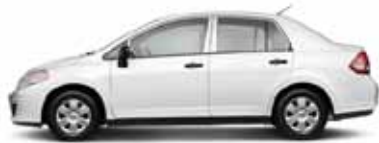
1.6 BASE: SEDAN ONLY