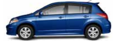
1.8 SL: HATCHBACK AND SEDAN