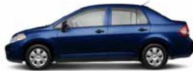
1.6: SEDAN ONLY