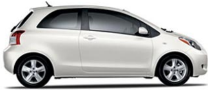
3-Door Liftback 5-Speed Manual (1421) MSRP* Starting At: $10,950.00