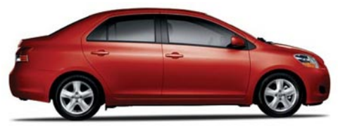
4-Door Sedan 5-Speed Manual (1441) MSRP* Starting At: $11,825.00