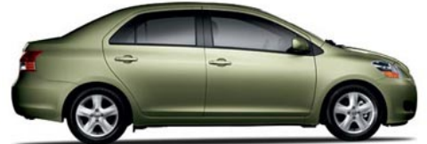
4-Door S Sedan 4-Speed Automatic (1452) MSRP* Starting At: $14,050.00