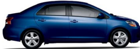
4-Door S Sedan 5-Speed Manual (1451) MSRP* Starting At: $13,325.00