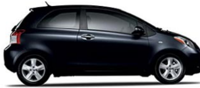
3-Door Liftback 4-Speed Automatic (1422) MSRP* Starting At: $11,850.00