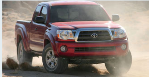
Access Cab 4x4 V6 shown in Impulse Red with available TRD Off-Road Package