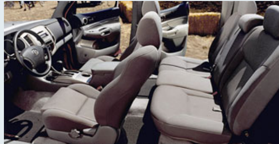
Tacoma Double Cab interior shown in Graphite with available TRD Off-Road Package