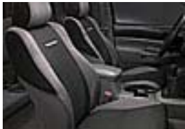
Seat Covers $199.00 Parts Only MSRP**