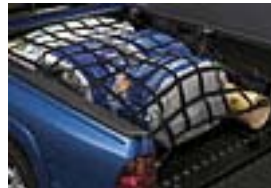
Cargo Net $49.00 Installed MSRP*