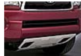
Front Skid Plate $205.00 Installed MSRP*