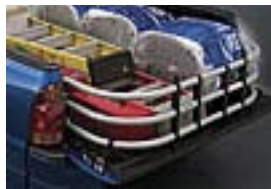
Bed Extender $282.00 Installed MSRP*