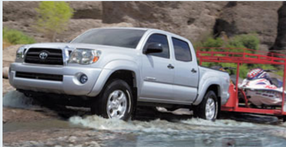
4x4 Double Cab shown in Silver Streak Mica with available TRD Off-Road Package and Towing Package