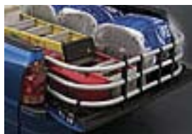
Bed Extender $282.00 Installed MSRP*