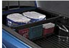
Cargo Divider $279.00 Parts Only MSRP**