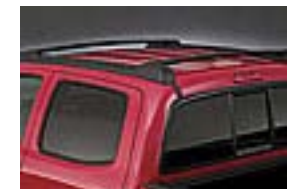
Roof Rack $339.00 Installed MSRP*