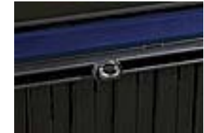
Mini Tie Down $40.00 Installed MSRP*