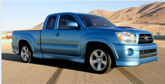
X-Runner shown in Speedway Blue