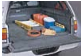
Bedrug Carpet Bedliner by Wise Industries $379.00 Parts Only MSRP**