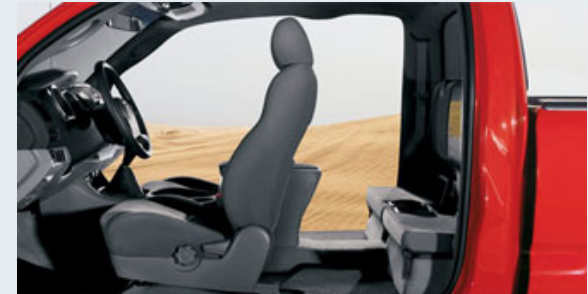
4x4 Access Cab V6 interior shown in Graphite with available TRD Off-Road Package