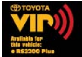
RS3200 + Security System $479.00 Installed MSRP*