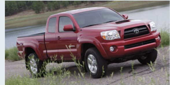
PreRunner Access Cab V6 shown in Impulse Red Pearl with available TRD Sport Package