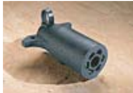
7 Pin to 4 Pin Adaptor $13.00 Installed MSRP*