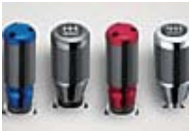
Shifter Knob by OBX Racing $49.00 Installed MSRP*