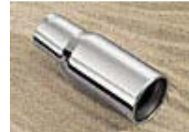
Exhaust Tip by Valor $69.00 Installed MSRP*