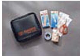
First Aid Kit $29.00 Installed MSRP*