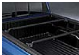
Cargo Cross Bars $124.00 Parts Only MSRP**