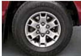
Baja 16 Alloy Wheels $695.00 Installed MSRP*