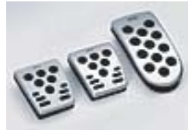
Sport Pedals by OBX Racing $79.00 Parts Only MSRP**