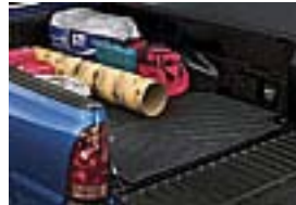
Bed Mat $119.00 Installed MSRP*