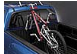
Fork Mount Bike Attachment $49.00 Parts Only MSRP**