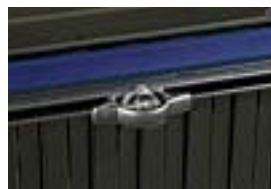
Cleat Tie Down $25.00 Parts Only MSRP**