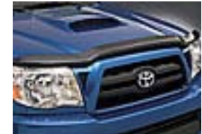
Hood Protector $119.00 Installed MSRP*