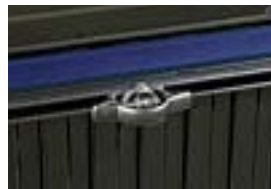
Cleat Tie Down $25.00 Parts Only MSRP**