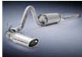
TRD Cat-Back Exhaust System V6 C & D Cab $520.00 Installed MSRP* V6 D Cab Long Bed $535.00 Installed MSRP*

These interior accessories are also available: