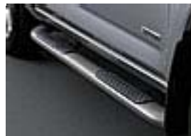
Tube Steps $450.00 Installed MSRP*