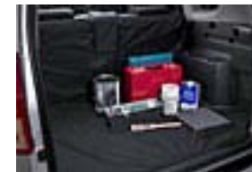
Cargo Liner $139.00 Installed MSRP*