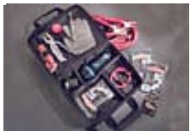
Emergency Assistance Kit $70.00 Installed MSRP*