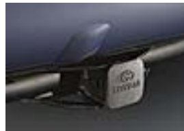
Towing Receiver Hitch w/o Tow Package - $750.00 w/ Tow Package - $820.00 Installed MSRP*