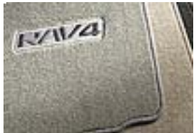
Carpet Floor Mats/Cargo Mat w/o 3rd Row Seat $199.00 w/ 3rd Row Seat $109.00 Installed MSRP*