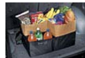
Cargo Tote $40.00 Installed MSRP*