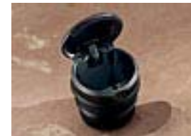
Ashtray Cup $17.00 Parts Only MSRP**