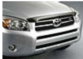
Hood Protector $135.00 Installed MSRP*