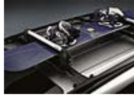
Ski Attachment with Adapters $194.00 Parts Only MSRP**