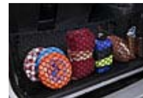
Cargo Net $49.00 Installed MSRP*