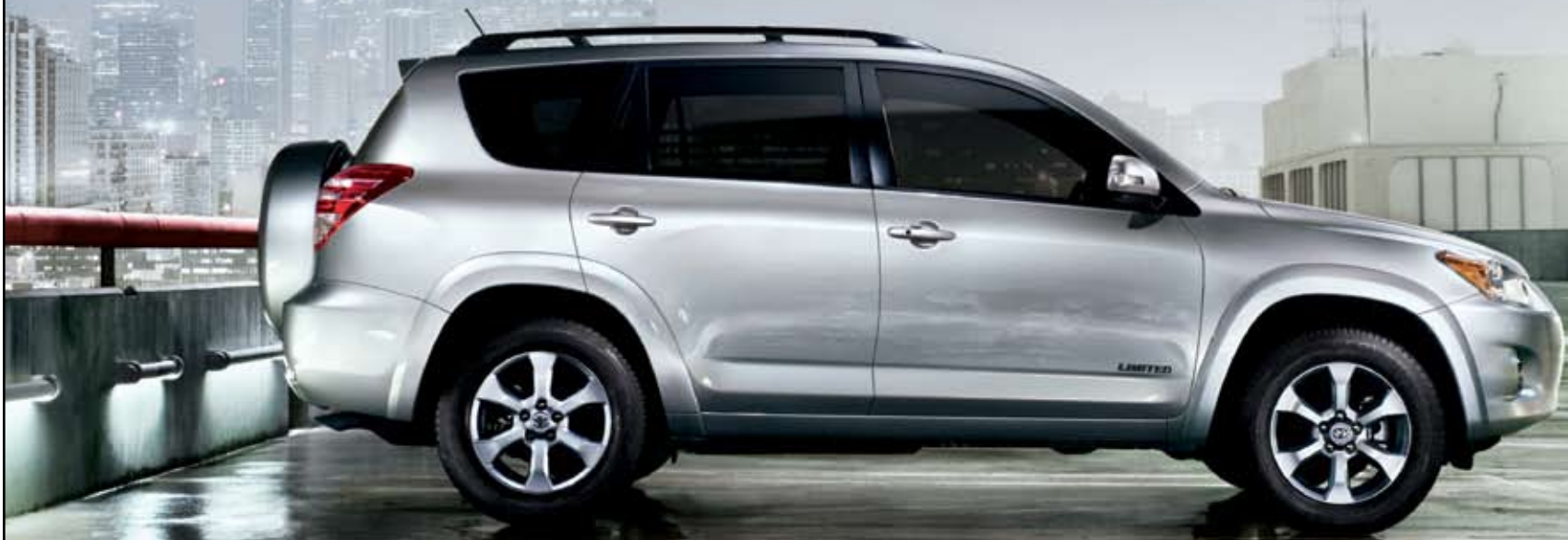
Limited V6 shown in Classic Silver Metallic Color