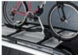
Bike Attachment with Adapters $244.00 Parts Only MSRP**