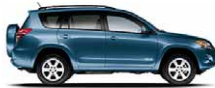
PACIFIC BLUE METALLIC 3 Ash, Sand Beige or Dark Charcoal 1,2 interior