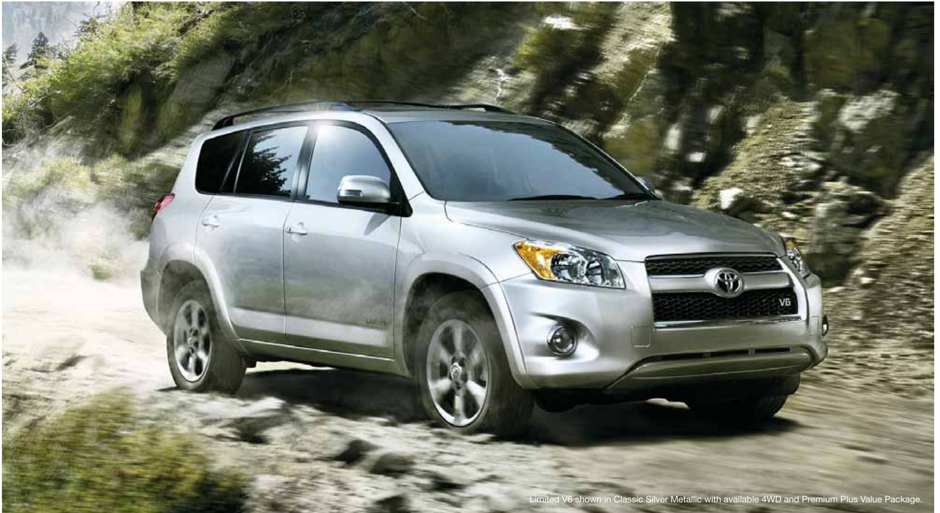
Limited V6 shown in Classic Silver Metallic with available 4WD and Premium Plus Value Package.

It's not surprising that a RAV4 gets an EPA-estimated highway rating of up to 26 mpg 1 . What is surprising is that it's a RAV4 4WD model powered by an available 269-hp V6. The secret is Dual VVT-i, an engine valve timing technology that optimizes power and fuel efficiency.