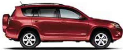
BARCELONA RED METALLIC Ash, Sand Beige or Dark Charcoal 1,2 interior