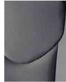
Sport leather in Dark Charcoal