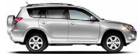
CLASSIC SILVER METALLIC Ash or Dark Charcoal 1,2 interior