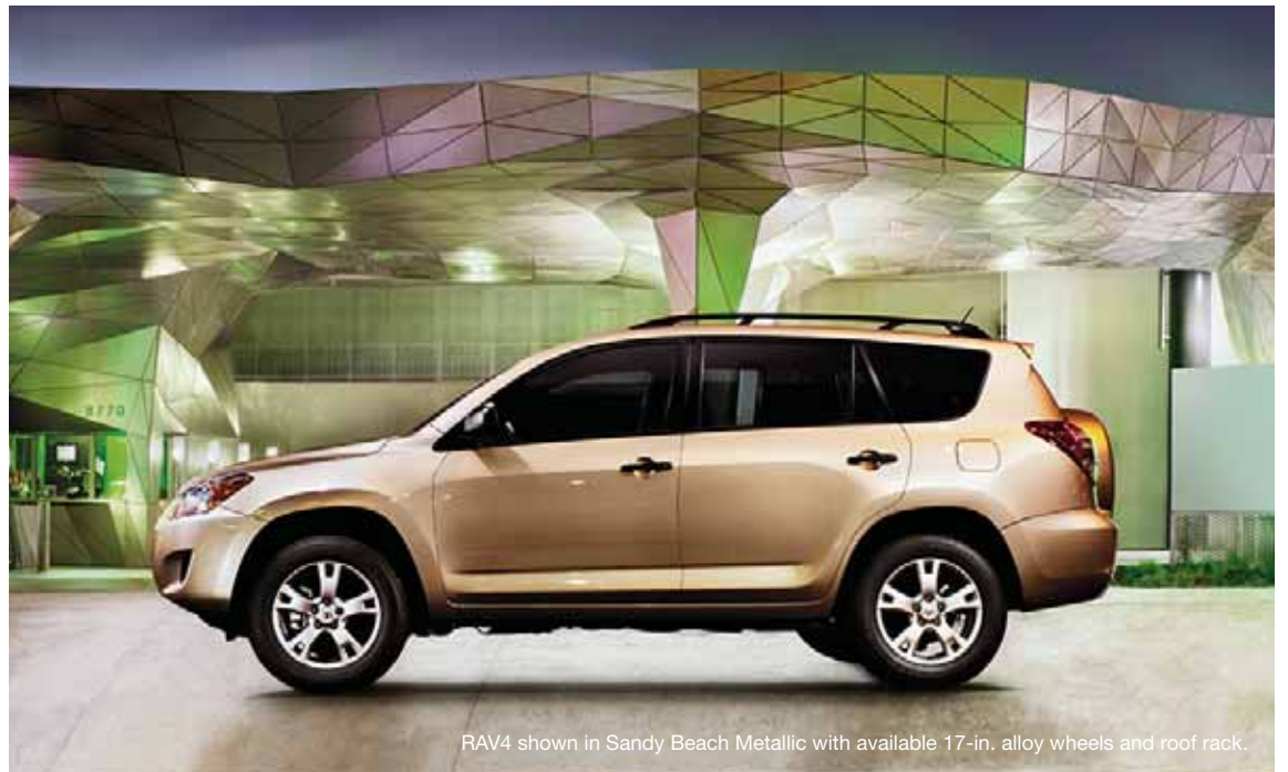
RAV4 shown in Sandy Beach Metallic with available 17-in. alloy wheels and roof rack.