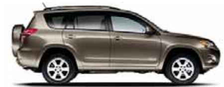
PYRITE MICA 4 Ash or Sand Beige interior