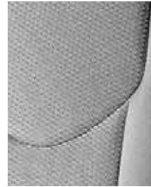
RAV4 available/Limited standard fabric in Ash