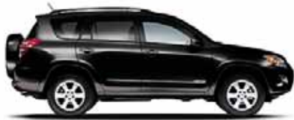
BLACK Ash, Sand Beige or Dark Charcoal 1,2 interior