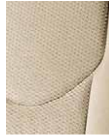
RAV4 available/Limited standard fabric in Sand Beige