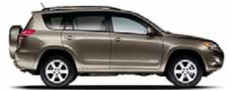
PYRITE MICA 4 Ash or Sand Beige interior