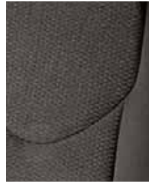
Sport fabric in Dark Charcoal