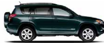
BLACK FOREST PEARL 3 Ash, Sand Beige or Dark Charcoal 1,2 interior