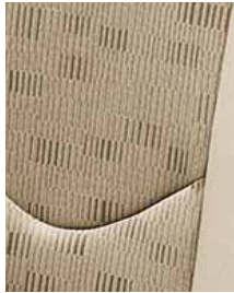
RAV4 fabric in Sand Beige