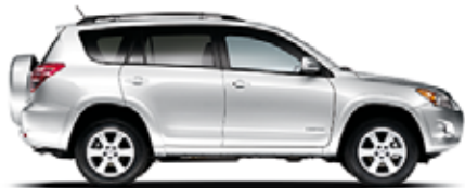
BLIZZARD PEARL 2,4,5 Ash or Sand Beige interior