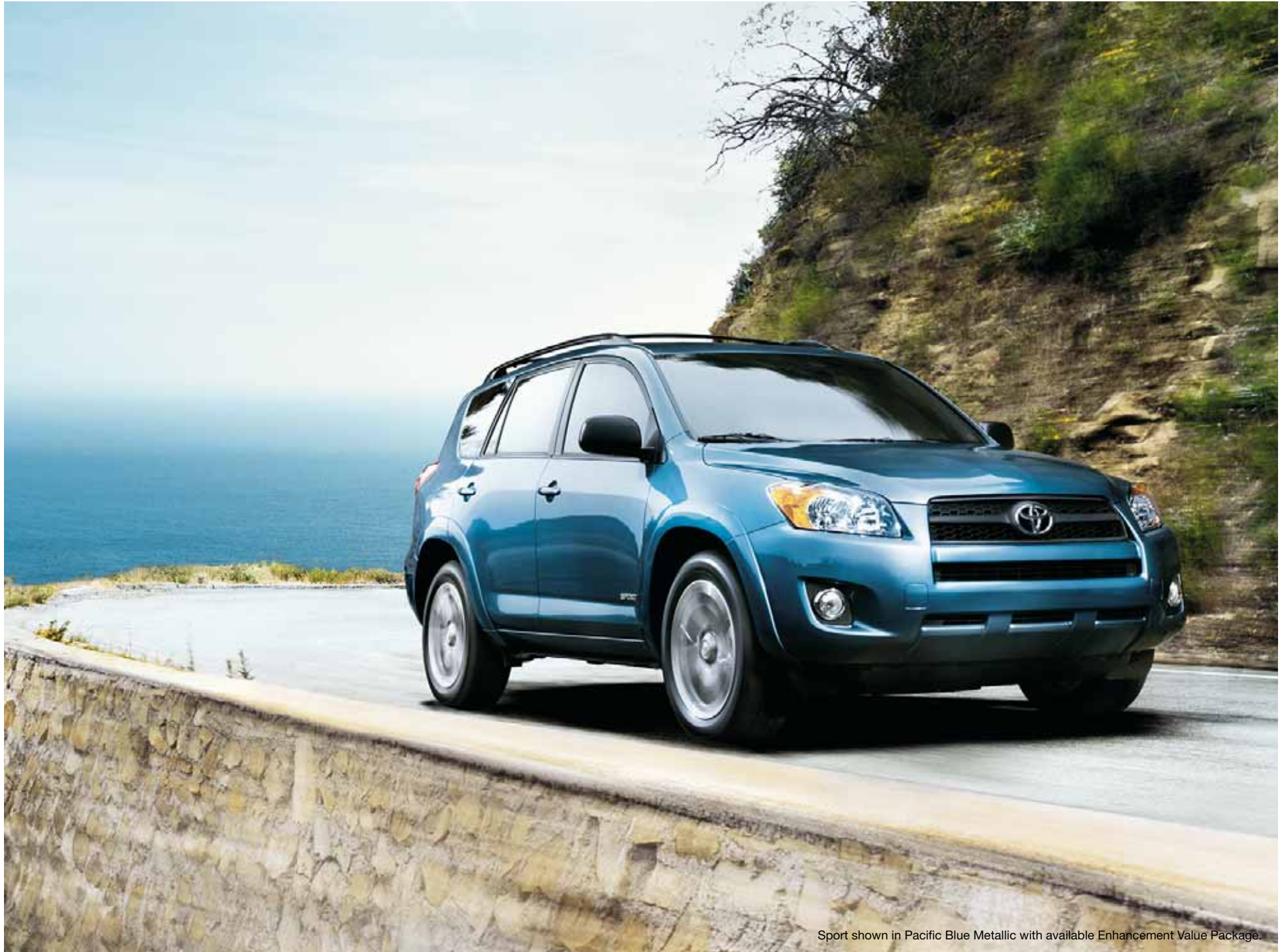
Sport shown in Pacific Blue Metallic with available Enhancement Value Package.