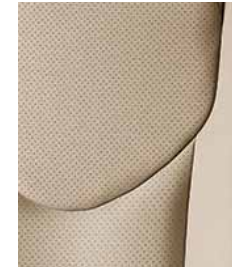
Limited leather in Sand Beige