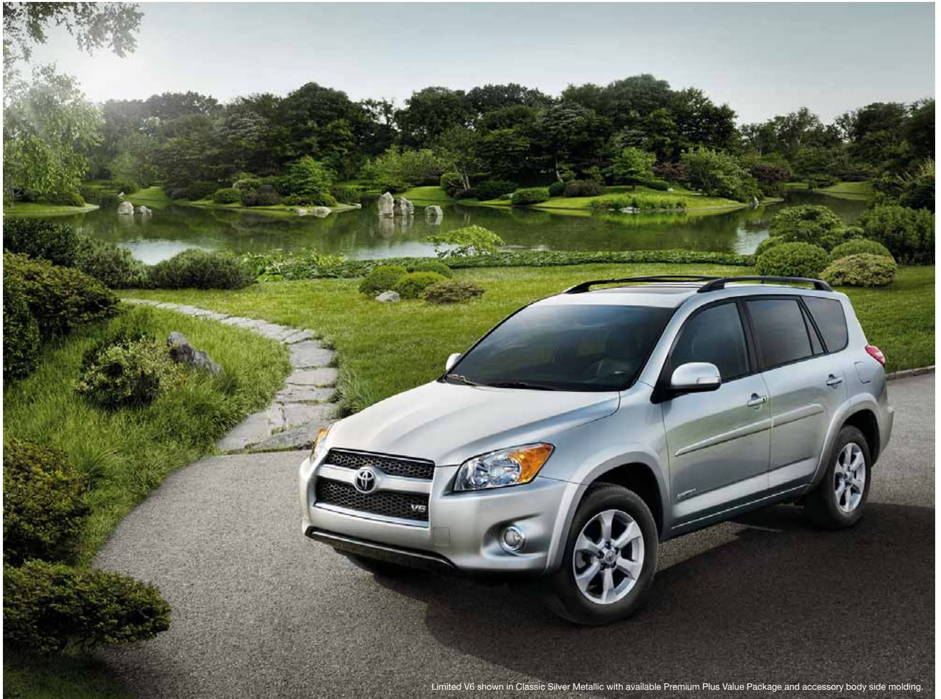
Limited V6 shown in Classic Silver Metallic with available Premium Plus Value Package and accessory body side molding.