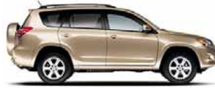
SANDY BEACH METALLIC 4 Sand Beige interior