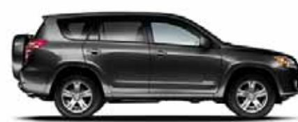
MAGNETIC GRAY METALLIC 1,2 Dark Charcoal 1,2 interior