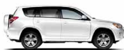
SUPER WHITE 1,3 Ash, Sand Beige or Dark Charcoal 1,2 interior