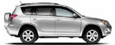
CLASSIC SILVER METALLIC Ash or Dark Charcoal 1,2 interior