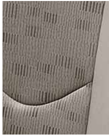
RAV4 fabric in Ash